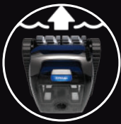
PATENTED EASY LIFT REMOVAL SYSTEM