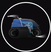
CYCLONIC VACUUM TECHNOLOGY