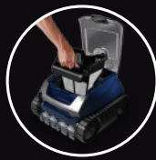
LARGE FILTER CANISTER WITH TRANSPARENT LID